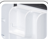
Inner door rack